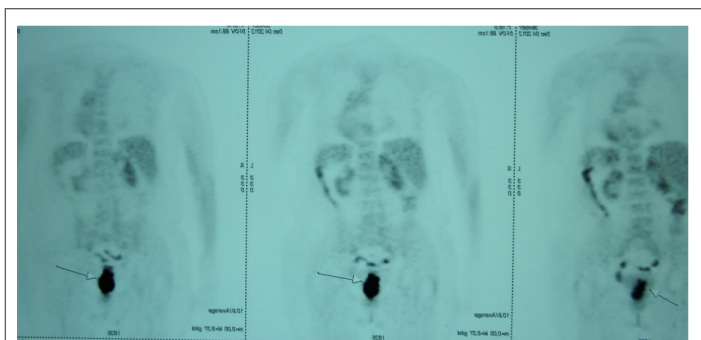
Figure 2: Whole body ( ^{18}\text{F} )-florodeoxyglucose (FDG)-PET-CT showing the presence of a mass, spanning a 5.5 cm segment of the rectum associated with rectal wall thickening.

Locally advanced rectal cancer cannot be resected without a high probability of leaving microscopic or gross residual disease at the original tumor site due to tumor fixation or adherence to neighboring tissue [9]. Hence, standard treatment in the case of most patients with locally